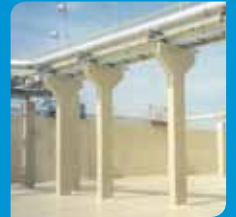
Waste Water Treatment